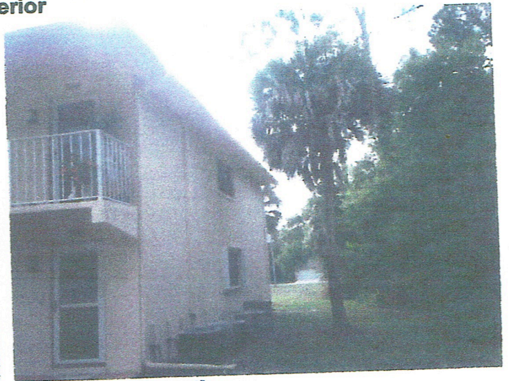
Right Side Elevation