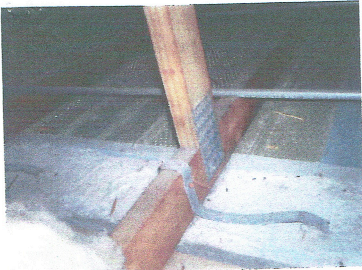
Roof to wall connections