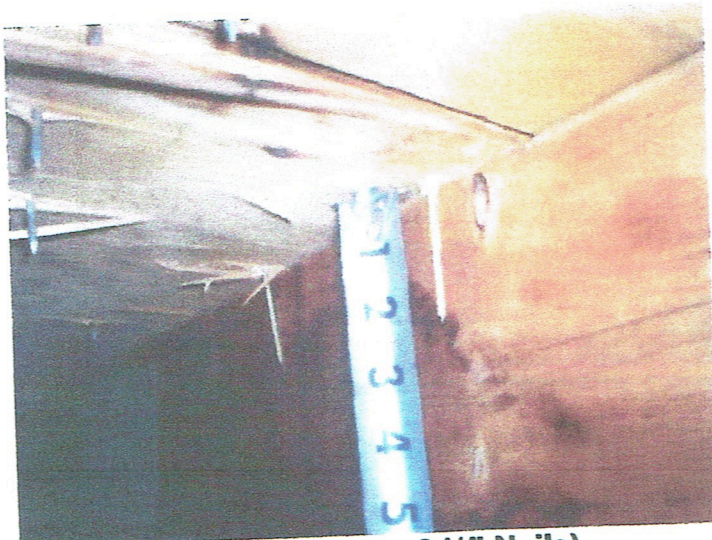
Roof Deck Fastener (8D = 2 1/2" Nails)