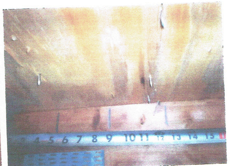
Fasteners spaced every 6"