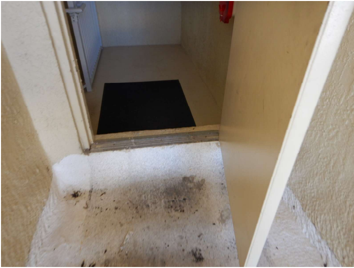
Reinforced Concrete Roof Deck.