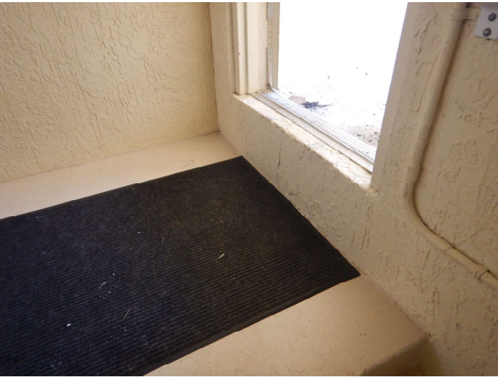
Reinforced Concrete Roof Deck.