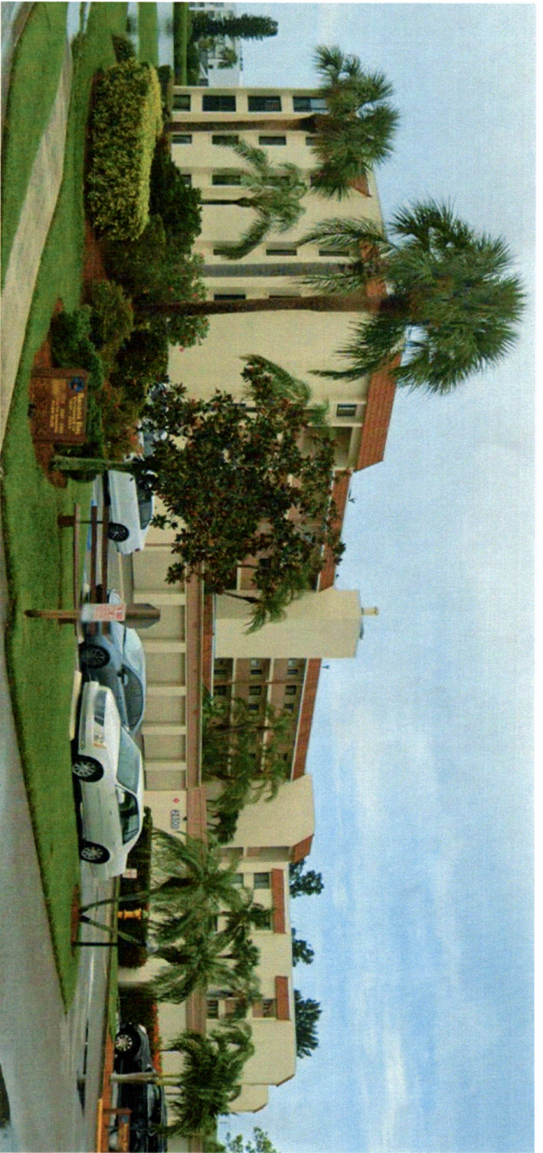
2400 Building Mansards