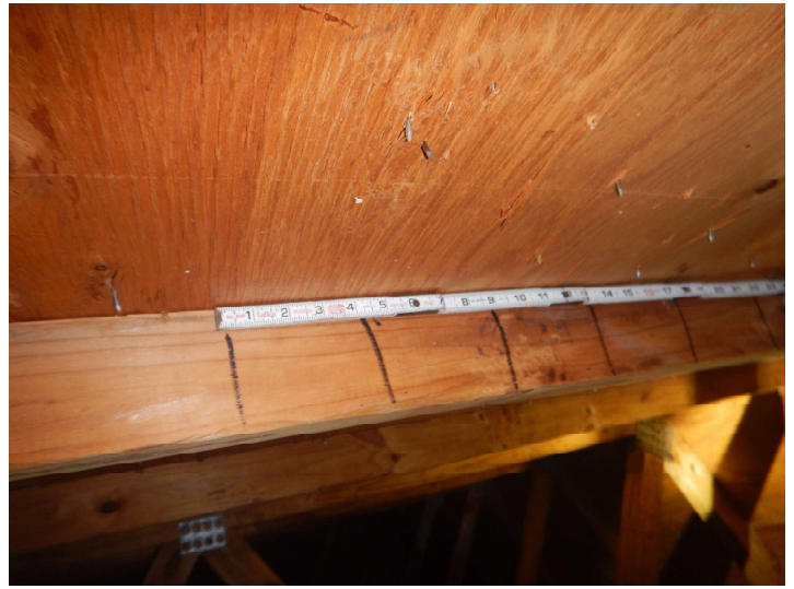
6x6 nail pattern