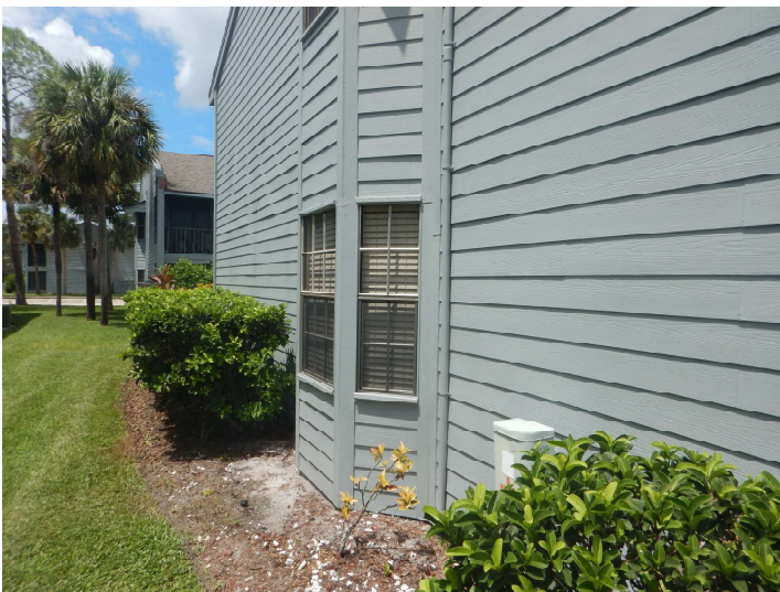
Openings not protected