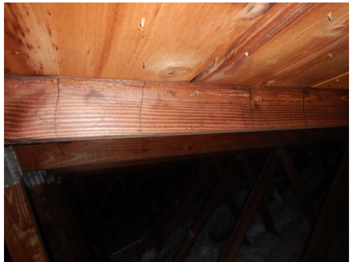
6x6 nail spacing