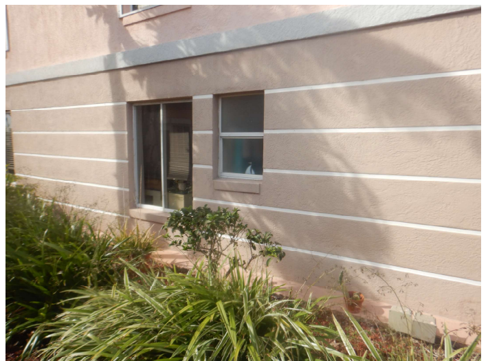
Glazed openings not all protected

343 N Tropical Trail Merritt Island, FL 32953