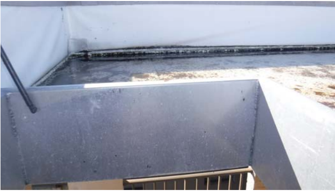
Concrete roof decking