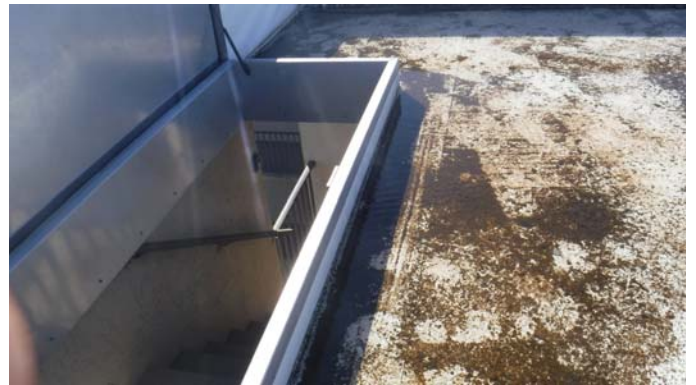
Concrete roof decking