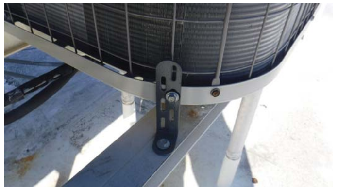
AC tie downs