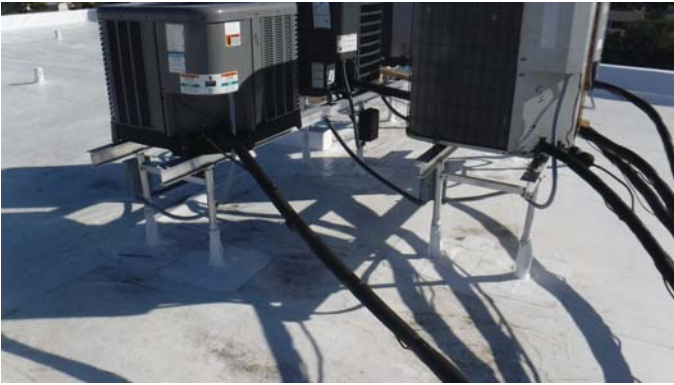
AC tie downs