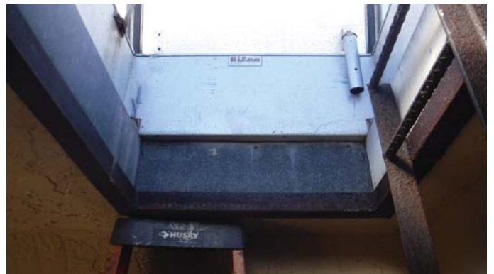
Concrete roof decking