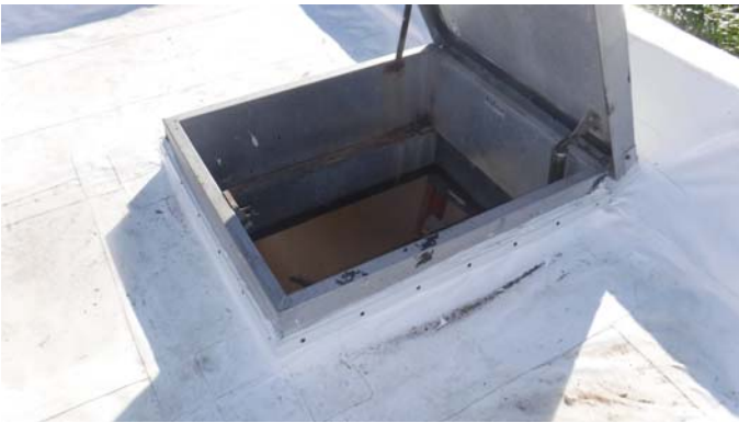
Concrete roof decking