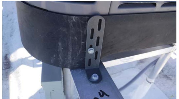
AC tie downs