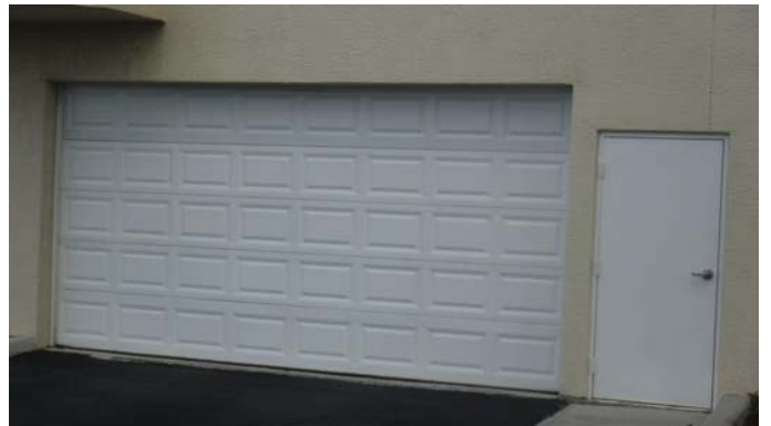
Non-glazed opening - not rated