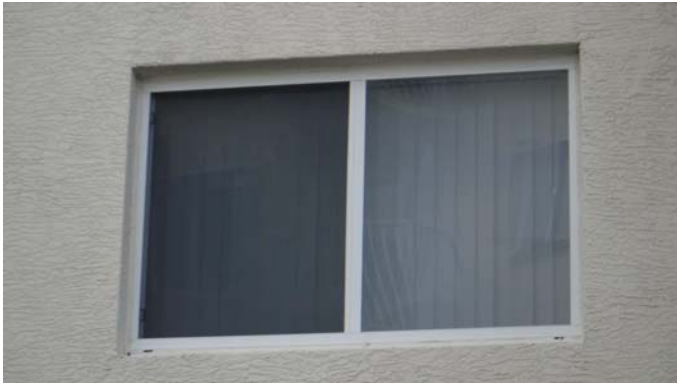
Glazed opening - not protected