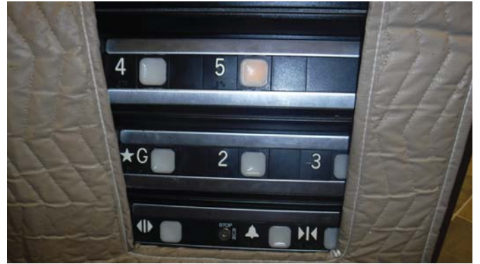
5 Story building