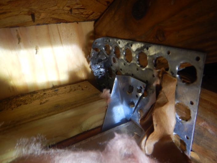
Clips 3 nails